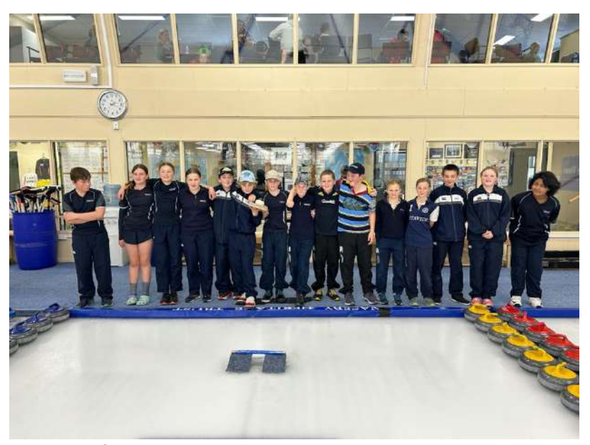
The first 3 placegetters in the year 7 and 8 category.