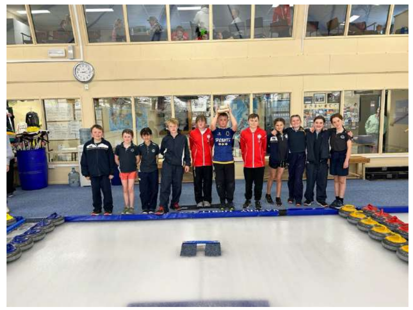
The first three placegetters in the year 5 and 6 category.