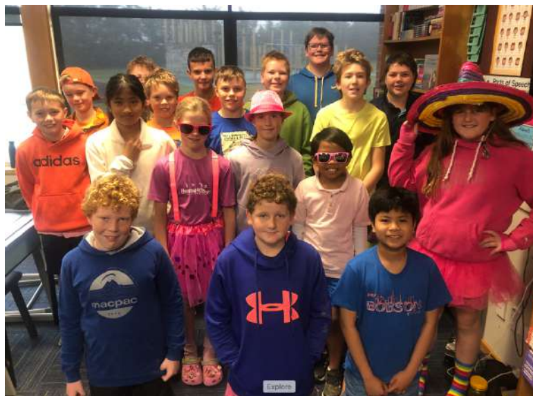
The Senior Room looking very colourful.

This week we have really made an effort to be confident and to give the gift of a compliment to others. I have encouraged the children to tell people what they notice they are good at doing and what qualities and characteristics they appreciate about them. It would be great to see this practice continue at home.