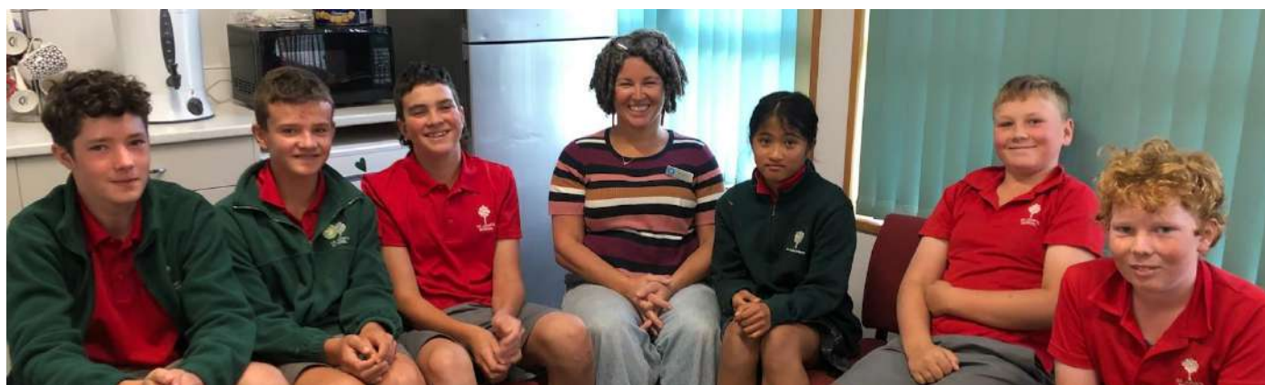
Our superb Young Vinnies Leadership Team